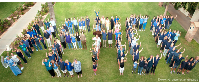
Aerial photo from Peace Day at the Casa, 2010.

Please arrive in the Palm Court at 5:30pm . The photo shoot will start at 5:45pm. Media has been invited. It is suggested that we all wear shades of blue to enhance the photo. Photo will be taken on the World Day of Peace, September 21, 2011.