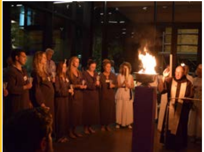
The Easter Vigil truly was a Night of nights! 21 Newly Initiated Catholic Adults & Teens.